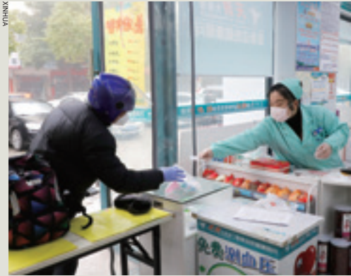
A deliveryman picks up medicine at a pharmacy in Wuhan, capital of Hubei Province in central China, on February 22

A marathon symbolizes the never-say-die spirit, where the participants challenge themselves, persevering to overcome their own limitations. The unavoidable cancellation will not stop people from following the spirit of the marathon, overcoming difficulties in their daily life and achieving more meaningful goals.