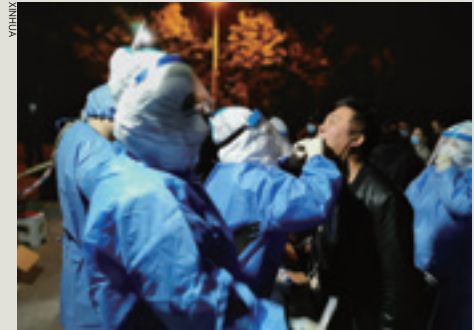
Medical workers take residents' swab samples in Tianjin in north China on November 10

Besides, economic policies should be adjusted accordingly. For example, the e-cigarette industry needs to control production and regulate marketing and promotional activities.